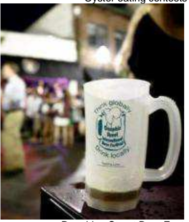
Dauphine Street Beer Fest