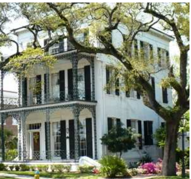
De Tonti district