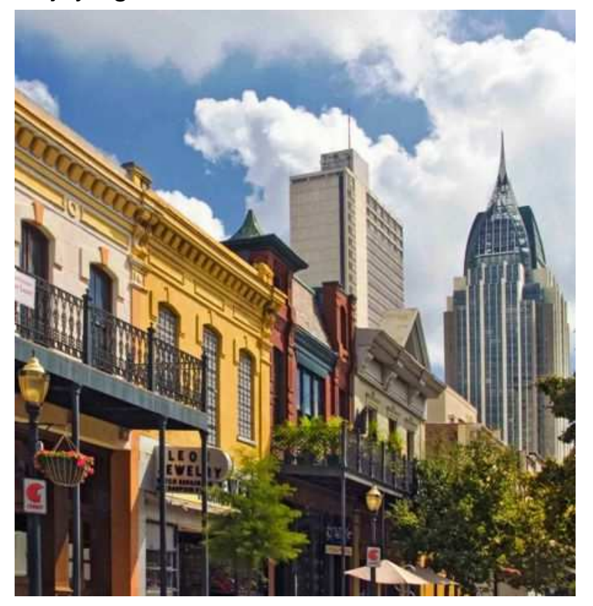
By Ashley Gibbins

The city of Mobile itself is located at the head of Mobile Bay while, around the bay, is Fairhope, as delightful a small American town as one could hope to find.